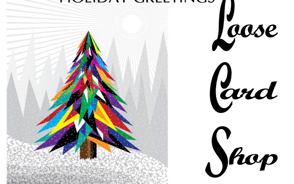
The LCS (Loose Card Shop) will be in full swing the next few months with an abundance of wonderful Holiday Greeting Cards. The deal, bundles of five cards for 50¢! Share the news with your friends and invite them to stop by.